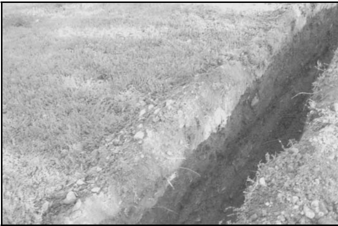
Plate 1. Trench showing buried surface beneath Terrace fill.