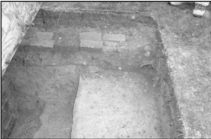
Plate 2. Excavation Unit showing old ground surface and pre- 20 th C. piers of unknown extension to main house.

Mt. Air has also been the beneficiary of Park Authority bond funds. Currently, contracting is underway for cellar hole preservation and stabilization of site elements. The unique design of the project will allow viewing of an 8-Datum Point