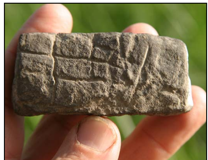
Etched piece of hornfels (pictograph) recovered from the Ramey site.