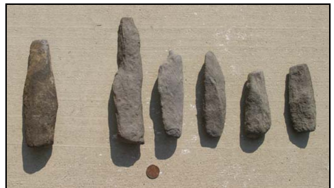
Knife/saw-like tools from Langert 1 and Ramey sites.

All approximately 900 bags of "goat feed" have been washed and are being sorted and catalogued. The sorting alone is a daunting task that hopefully will be done before the end of the winter lab season.