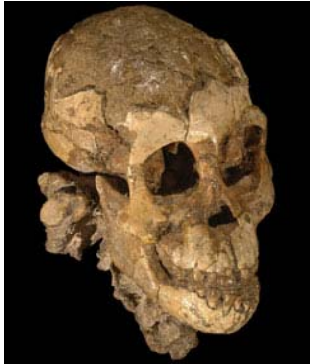
The ancient child's skull discovered in Ethiopia.