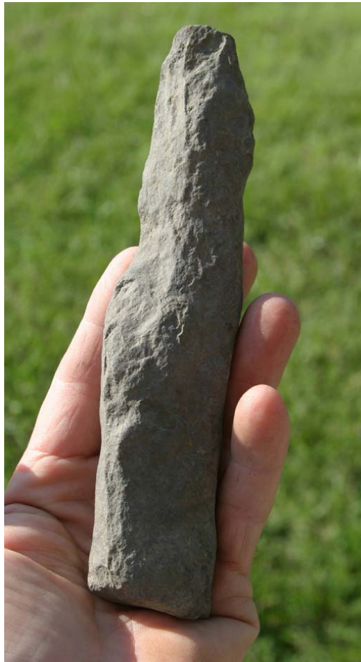
Large, reworked knife/saw-like tool from Ramsey.

During the cataloguing material collected after the site had been stripped, we identified additional unusual artifacts. These included the atlatl weight fragment shown in last month's DP, and the "one-piece" knife/saw-like tools mentioned last month and what is emerging as possibly the most significant single artifact in the collection.