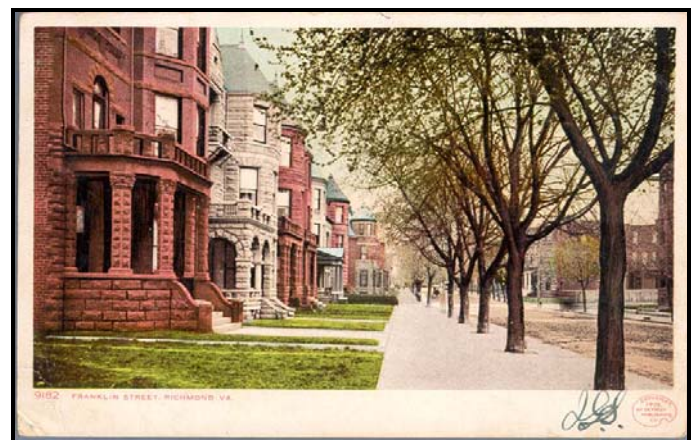
Franklin St., Richmond, Va. Detroit Publishing, Co. - 1905

VCU has a wonderful online exhibition of Richmond in Postcards. The collection is comprised of over 600 postcards, most dating from 1900-1930. The collection's URL: