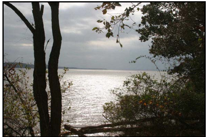
Overlooking the Potomac River at Sycamore Point

The crew has completed the first two 10x10-foot excavation blocks. The recent heavy rain event has finally made the clay sub-soil receptive to troweling for visible soil features. That has only just begun.