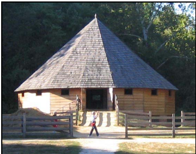
Wheat Threshing Barn at Mount Vernon

George Washington's farm marks the beginning of the wheat harvest season July 4 with wheat-treading demonstrations at the George Washington: Pioneer Farmer site. Costumed staff will lead Mount Vernon's horses as they tread wheat in the 16-sided barn at 10:00 a.m., 11:00 a.m., 1:00 p.m., and 3:00 p.m. every day. Visitors can witness Washington's innovative treading process, learning first-hand how Washington separated grain from straw.