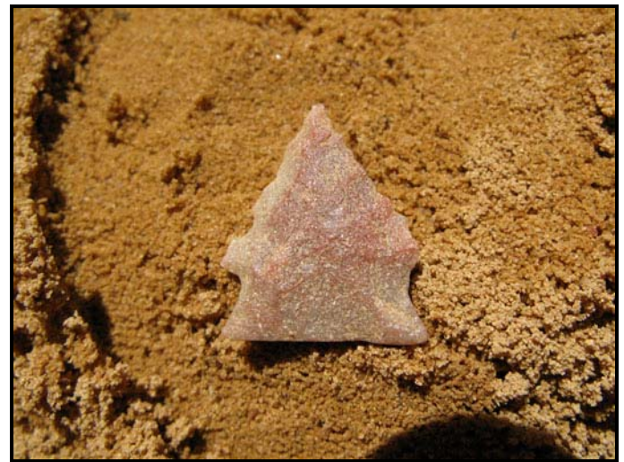
Heavily reworked, quartzite Plamer point from 25-27" deep

Dave Rubis , who several years ago died suddenly while volunteering to clear trails in the Bull Run Mountains, helped with numerous sites as well as Cactus Hill and also was the inventor of the Rubis Hydro-Level or water level as it is commonly called. It proved to be an invaluable replacement for the often inaccurate line