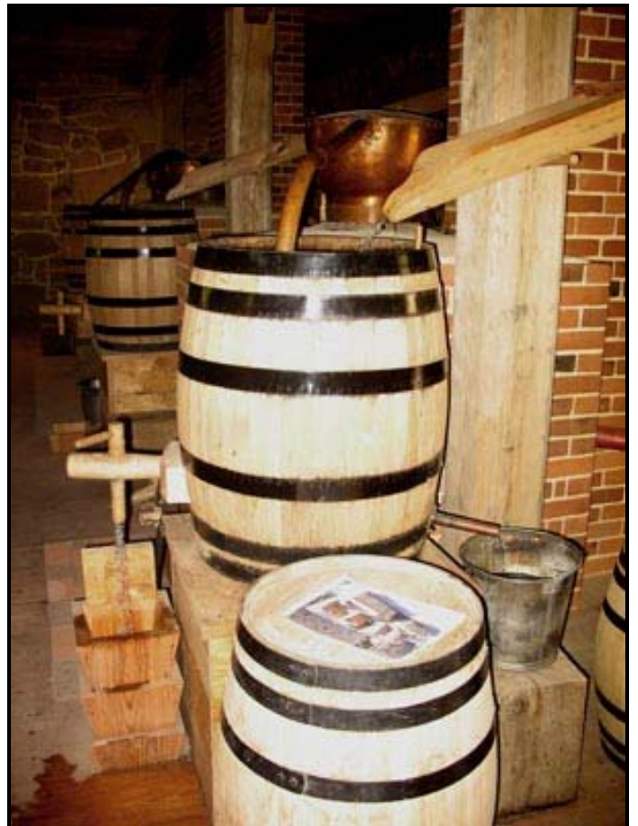
Inside the Distillery distilling water for demonstrations