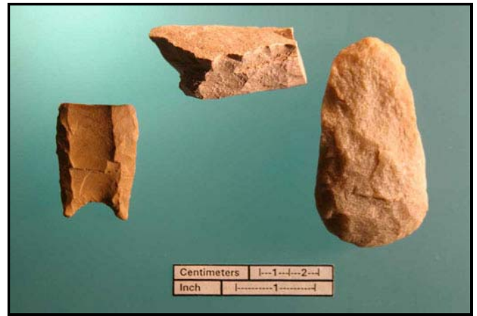
Jasper unifacial core and quartzite celt from 35" deep

Recent work in southern Virginia by a crew from the Northern Virginia chapter and other ASV volunteers has identified a new Paleoindian site. It was named for two people who were indispensable to the NVC's and ASV's excavations at the Cactus Hill Paleoindian site.