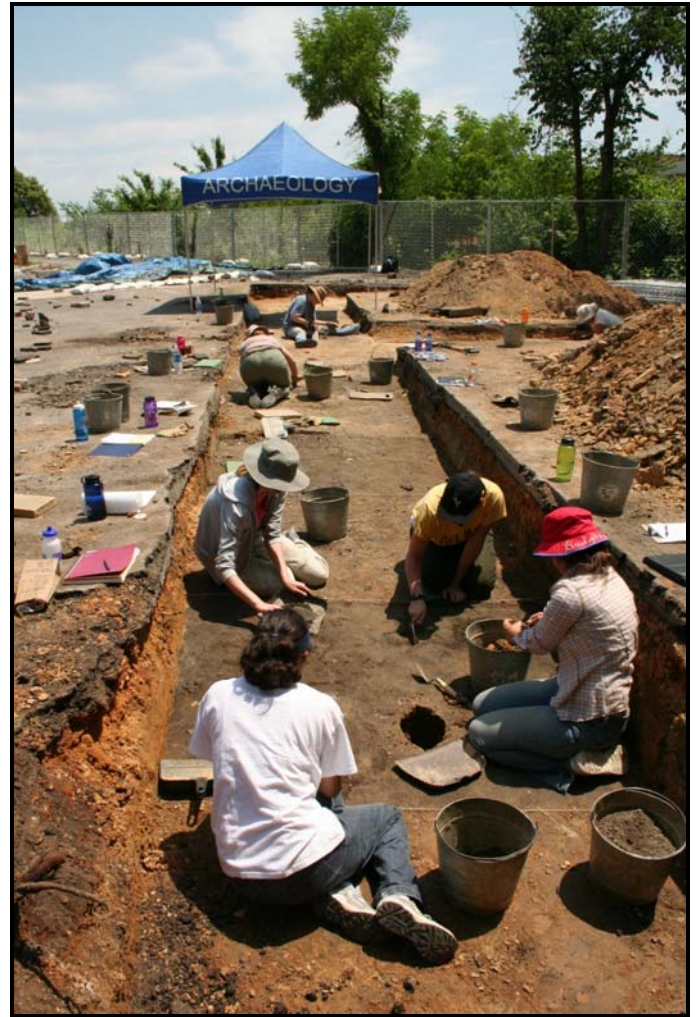
Field School students from George Washington University at the Freedmen's Cemetery

Last week City archaeologists began their investigation to identify and preserve graves for the future creation of Alexandria Freedmen's Memorial Park, due to open in 2010.