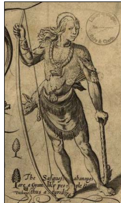
Image from the map described by Captain John Smith http://hdl.loc.gov/loc.gmd/g3880.ct000377

Potomac. This tumultuous native political landscape affected the development of relations with the invading Europeans and the course of colonial and imperial powers in the region from the Great Lakes to the Virginia Capes. A combination of archaeological, ethno historical, and historical data provide the foundation for new perspectives on the critical sixty years following the establishment of Jamestown.