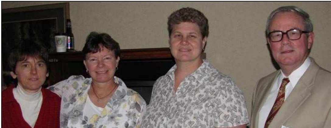
The Beer30 group strikes again!