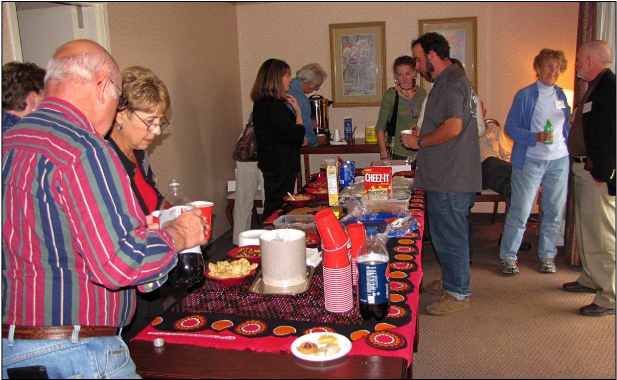
What a spread they put on in the Hospitality Room!