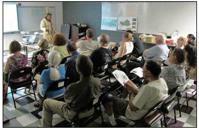
A full classroom listened intently to the chief as he explained their recent recognition by the State of Virginia. He also recited several dozen tribal words that came from history including those from a list by Thomas Jefferson.