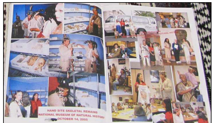
He also brought tribal reading material!