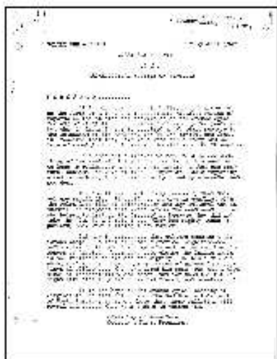
Page one of Vol. 1, Issue 1, 1942

The ASV has completed the task of digitizing the entire run of Quarterly Bulletins from the beginning of the ASV in 1940 (with the first QB in 1942, and a short WWII hiatus) to 2010. Each of the 255 issues are scanned and in searchable PDF format. The digital QB is available on an 8GB memory stick for $15.00.