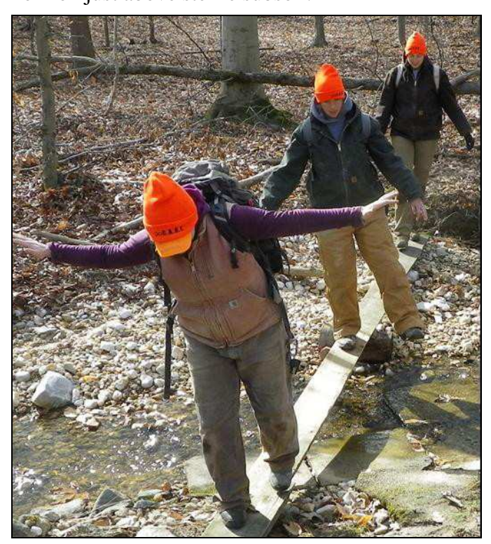
It can be a haul out to the ridges, but worth it for one of the prettiest areas on the park

However, based on the data to date, it looks like we may have stratified deposits. What initial analysis indicates is Early Woodland pottery has been recovered from near the transition between the organic layer and B horizon. After a discernable void, the artifacts increase near the base of the B horizon just above sterile subsoil.