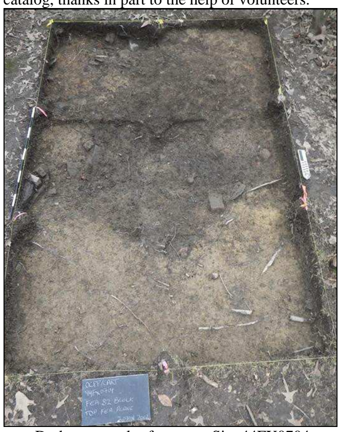
Dark rectangular feature at Site 44FX0704

Speaking of the water table, when the historic crew's units are not inundated, they are out at 44FX0704, a.k.a. the "Cemetery Site." Excavation has begun into a dark, rectangular feature. So far it has been impressive for the amount and diversity of faunal material. We have several species represented and are even getting fish scales from the water screening. When the water table has been up, the historic team spends its time at JLC processing artifacts. They are getting caught up with the catalog, thanks in part to the help of volunteers.