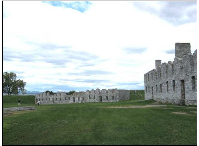
Crown Point on Lake Champlain