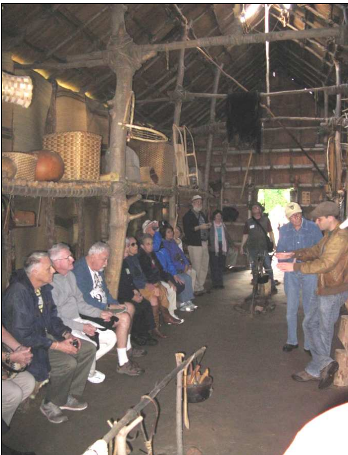
Inside an Iroquois longhouse

Artifacts from the site, including the colonoware assemblage will be on display. Presentations will be fewer but more diverse than originally expected and will include details of the history and archeology at the Accotink Quarter site, information