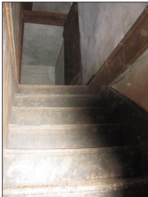
Stairwell to upper story