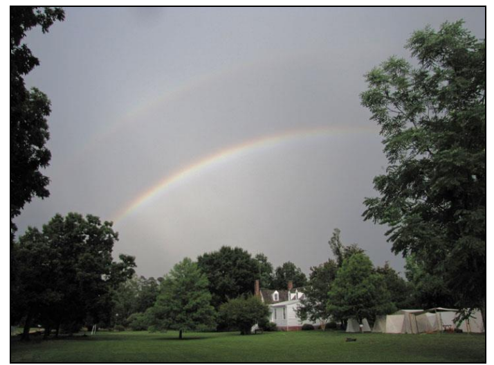
Double rainbow over Kittiewan