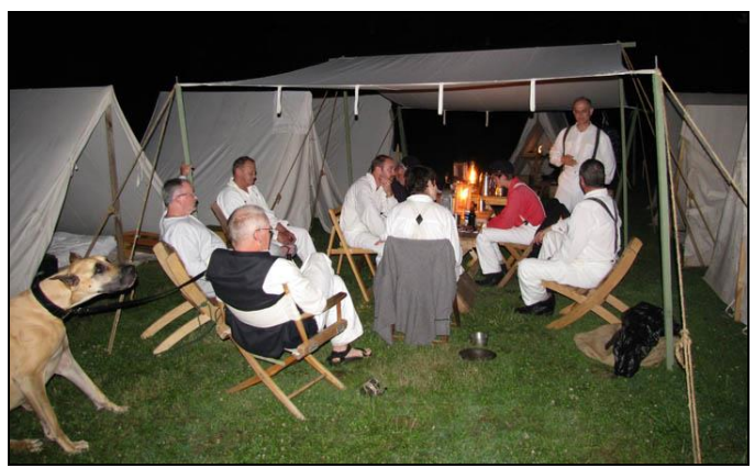
Reenactor tent life at night