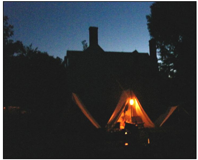
Tent by Kittiewan at dusk