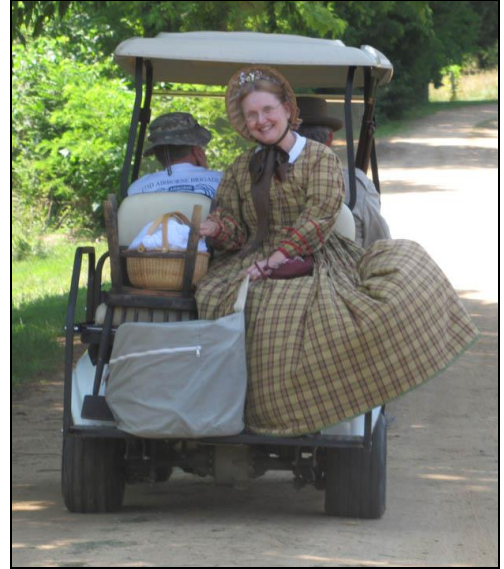
Reinactor in golf cart limo