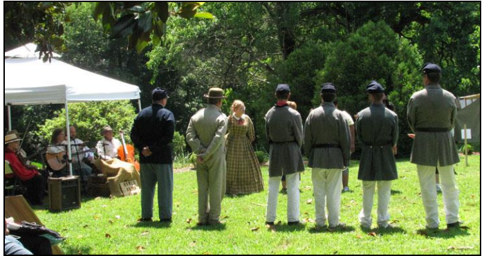
Civil War period dancing and music