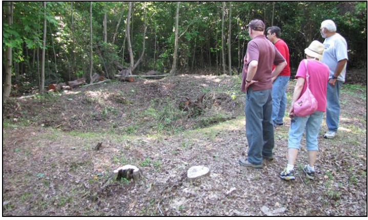
Tours of gun pit on Civil War Trench Trail