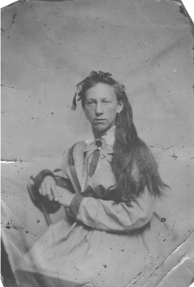
Tintype Photograph of a Native American (mid-1800s)

all of which I will turn over to the National Indian Museum in Washington, DC. I understand that the photography department at JMU is teaching a class on how to make tintypes. Did this individual know we would be looking at him 150 years later; I think it is called history.