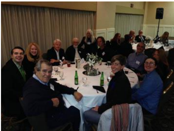
Another NVC table at the banquet