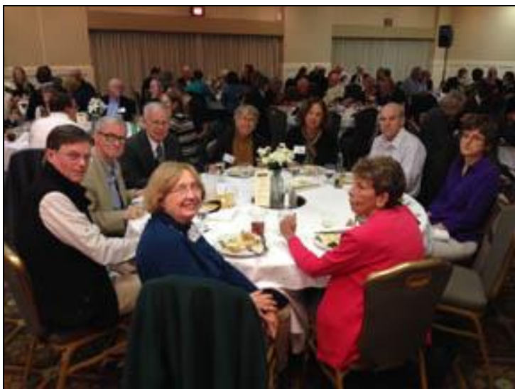
NVC table at the banquet