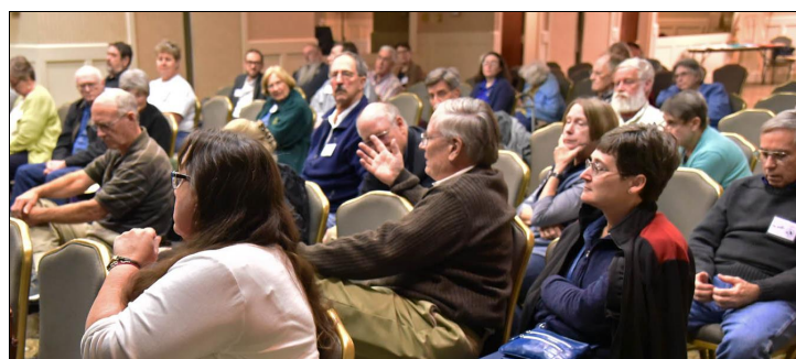
The presentations were packed