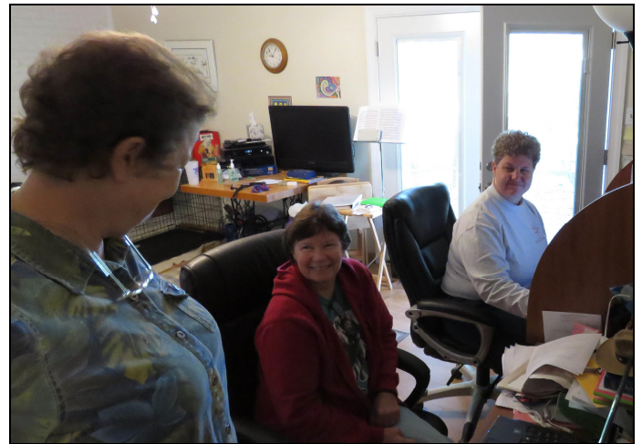
Name tags and envelope labels crew