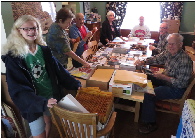
Before the conference, NVC members gathered for an envelope stuffing party!

December is our annual Holiday Party - please be prepared to hear about preparations. For new members, we always hold our annual elections just before digging into some awesome food and fellowship. Everyone is encouraged to bring a dish to share. We'll be in the Urbanites Room for the party.