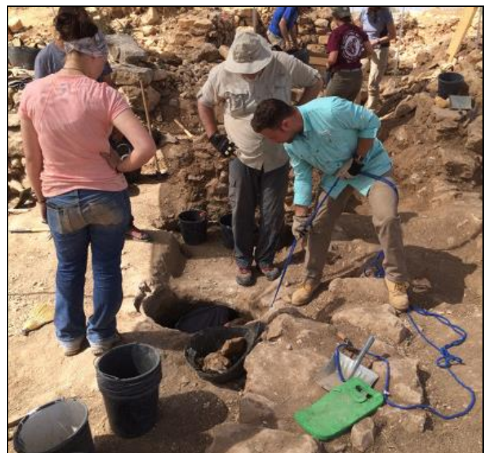
One KeM square's team in action at cistern - don't let go!