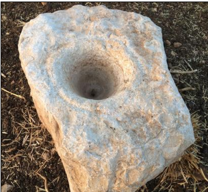
Late Bronze gate socket