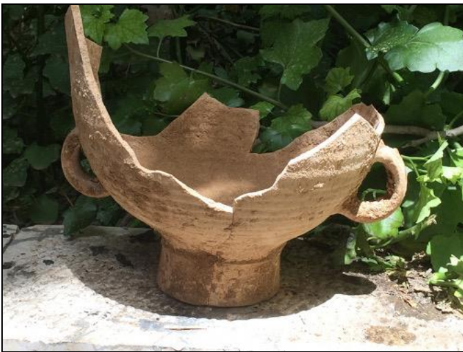
First Century AD storage jar