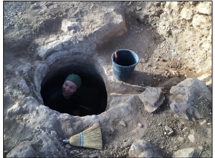
First Century cistern/winepress