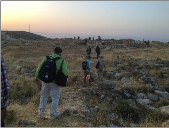
Pre-dawn arrival at Khirbet el-Maqatir