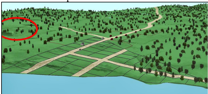
Kings Hill west of Colchester