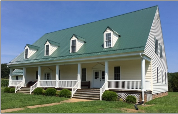
New roof on Kittiewan Visitor's Center