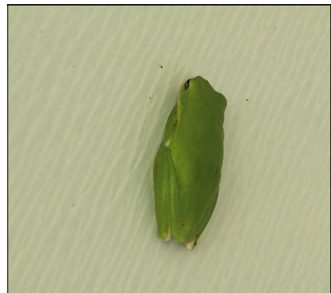
A local neighbor listened in from one of the porch pillars.