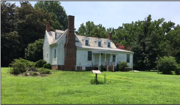
Kittiewan, the house