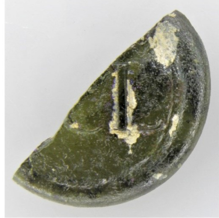
A BOTTLE OF LIQUOR AT NEWGATE TAVERN, 1787 TELLS TALES OF THE PAST

We hope everyone has a safe and happy holiday season! Please note that we are not taking volunteers at this time, and our offices remain closed until further notice. We will post new opportunities on the Volunteer Management website when they become available. Until then, ACB volunteers are encouraged to share their talents with other branches and/or parks where opportunities are now available. For more information, please visit Fairfax County's Volunteer page for more information. If you would like to be notified when we can accept volunteer assistance again, please email cartarchlab@live.com