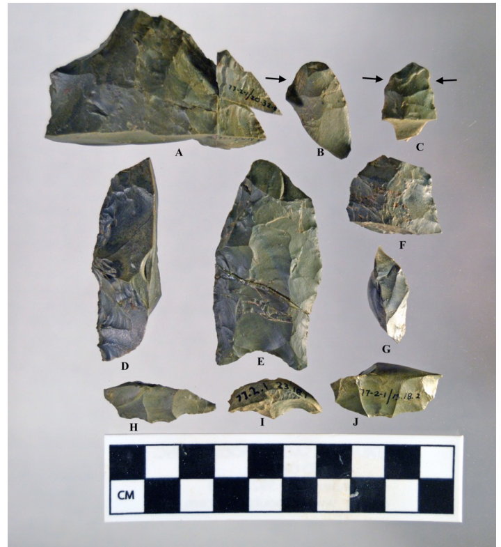
Figure 2. Biface fragments from fluted point production. All Normanskill chert. A. Large biface fragment with refits; B. Preform distal fragment, arrow indicates isolated tip; C. Overshot channel flake retaining distal preform fragment, arrows indicate isolated tip; D. Biface lateral fragment; E. Fluted preform refit from two fragments; F. Preform medial fragment; G. Biface lateral fragment; H-J. Fluted preform basal fragments.