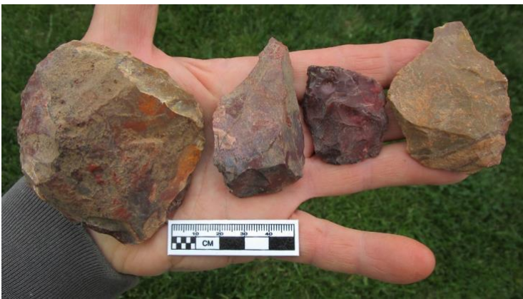
A concentration of four jasper artifacts were recovered from the contact between the bottom of the plowzone and the “sub-soil.”