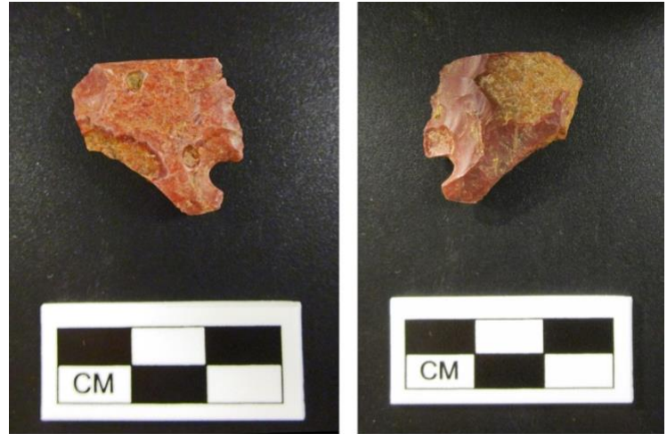
Jasper Ridge Perc Test 2