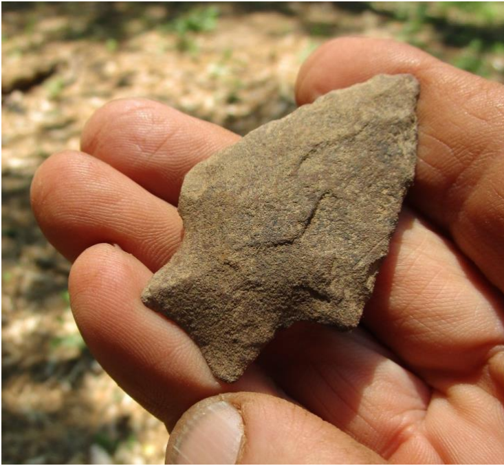
A Savannah River point made of ferruginous quartzite.