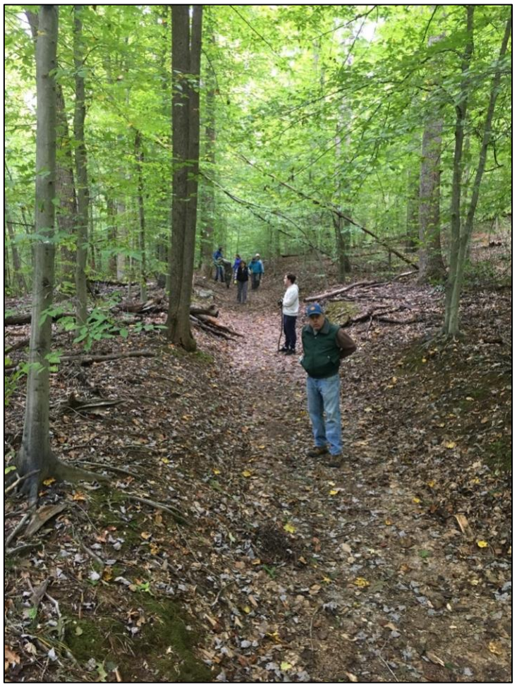
Team in old road bed