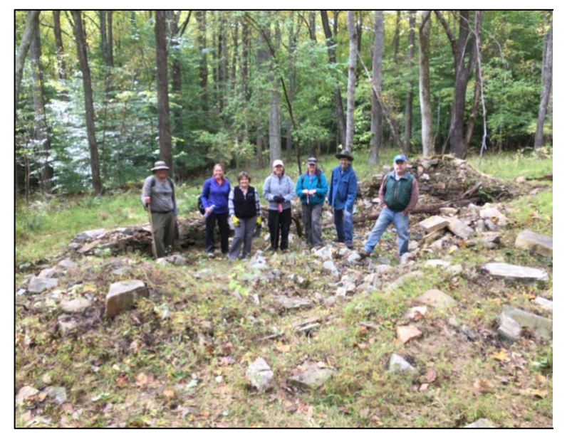
Team in old foundation