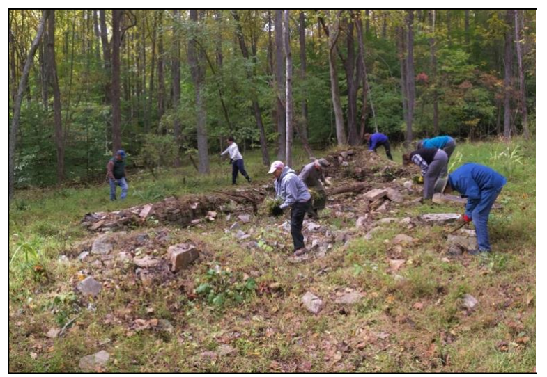
Team clearing the stone foundation

Spent this past Saturday with many chapter members at the Preserve mapping a site with a stone foundation and cemetery. Only saw first half 20<sup>th</sup> century artifacts on the surface, but site goes back to at least 1853 (stone in the nearby cemetery). Records suggest the site may go back to the mid-1700s! When we finally do some STPs, then maybe more will come to light. If you need a site for Certification, let me know!