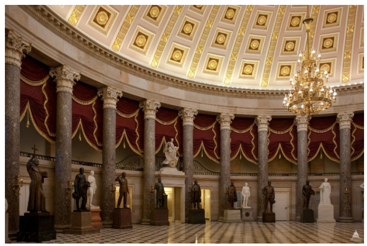
Potomac Marble columns in old House chamber

the British used to actually burn the stone buildings, how stone was quarried in the early 19th century, along with sample quarry tools, and the utilization of George Washington's Potomac Canal to ship the stone to D.C. for carving.