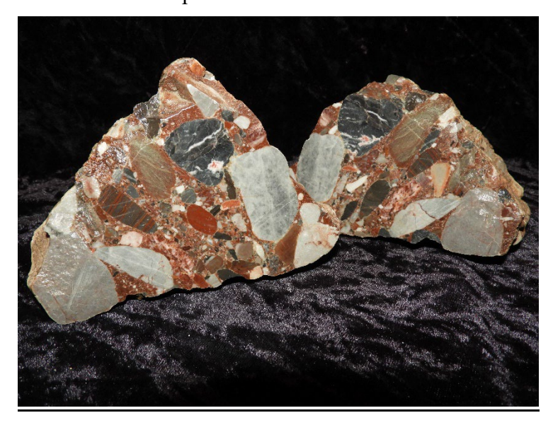
Polished Potomac Marble sample showing inclusions.

functional, they had to be beautiful. As classicists, their notions of beauty were derived from the ancient Greek and Roman republics. Like the Greeks and Romans, their preferred building material was marble. The question was, where was such building material to be found? The building material that was discovered and used was Potomac Marble, which exists in abundance on both sides of the Potomac River, extending from Leesburg to Montgomery County. It is not actually marble, but a limestone conglomerate. Architect of the Capitol Benjamin Latrobe and President Monroe rode up and down Loudoun and Montgomery counties opening up quarries, and despite many problems and political opposition, Latrobe was able to build the beautiful columns in the Capitol from this marble.