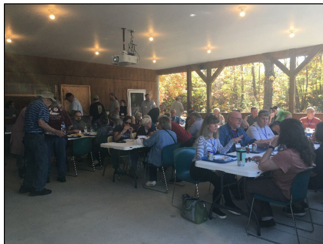
Picnic at Longwood University Field Camp