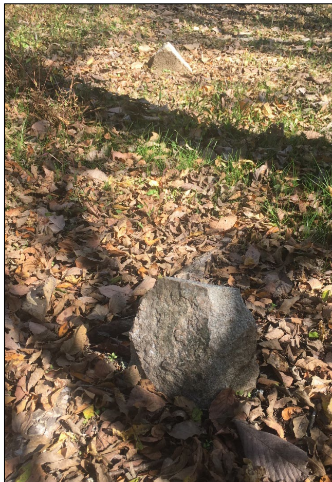
Head and foot stone of enslaved person's grave at the Diamond Hill Cemetery at Berry Hill. 300+ graves in the cemetery.

Featured on the Fairfax County Park Authority blog Our Stories and Perspectives is "History Found Just Below the Surface". In June 2016, the Fairfax County Park Authority archaeology team uncovered a unique corduroy road that was discovered during a routine road maintenance project near an entrance to Lake Accotink Park. To learn more please visit https://ourstoriesandperspectives.com/2018/10/29/history-found-just-below-the-surface/