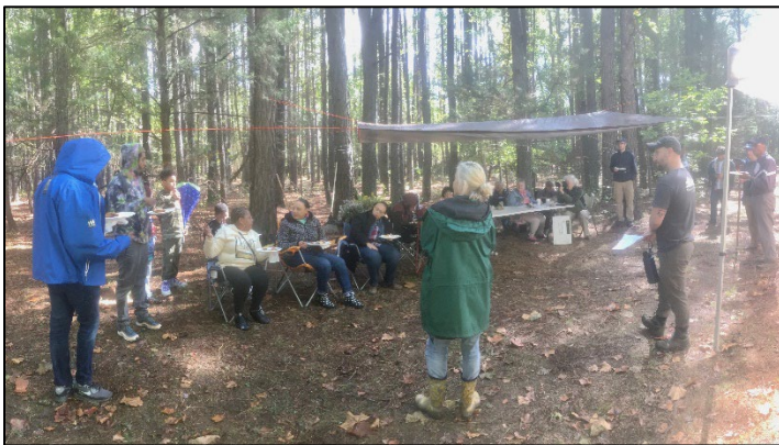
Family members talking about their history to VOF staff.