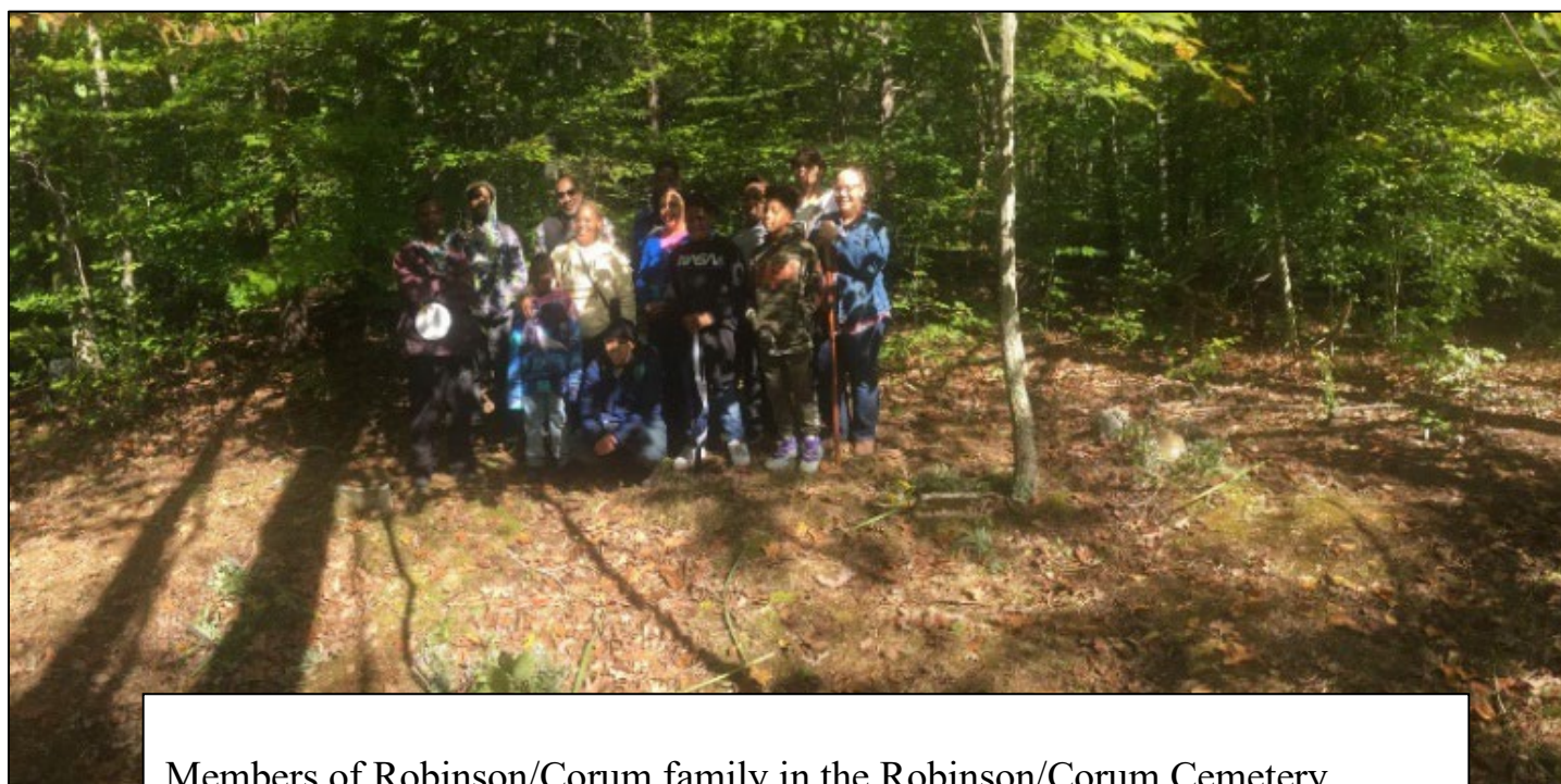
Members of Robinson/Corum family in the Robinson/Corum Cemetery.