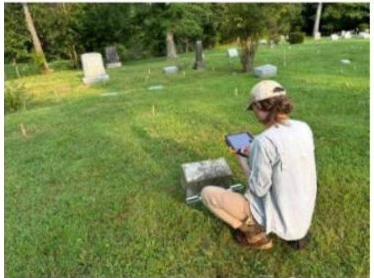
CART staff uses a tablet to document a grave at Cranford United Methodist Church cemetery.

Earlier this month, CART staff surveyed the Cranford United Methodist Church cemetery. A recent ground penetrating radar (GPR) survey contracted by the church revealed the location of unmarked burials in the cemetery.