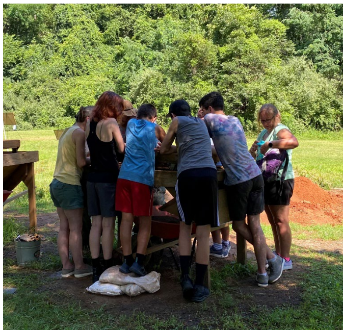
Visitors screen soils from nearby excavations

A table was set up with examples of artifacts found at the site, along with people who could answer the visitors' many questions. The wind fought with the staff and volunteers, but most of the documents and example objects remained in situ for the day.