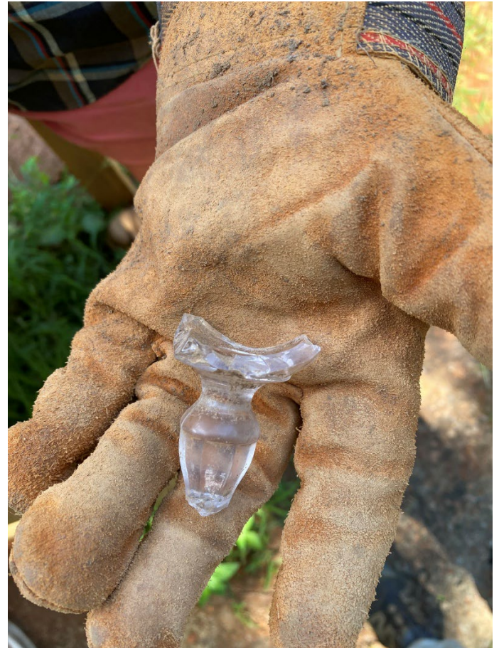
A fragment of glass stemware recovered during the Open House

The discovery of a feature and its interpretation was a hot topic among the visitors, and a lot of questions were asked by a curious public. An important aspect of archaeology is informing the public of what is found, and both above and below pictures are perfect examples of this in practice.