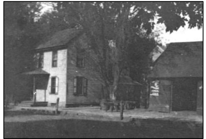
Kielkopf House and Blacksmith Shop