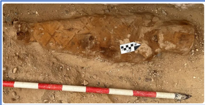
Mummy is around 1,600 years old

Archaeologists working at the ancient city of Oxyrhynchus in Egypt have unearthed a mummy with a passage from Homer's "Iliad" stuck to its abdomen, in a first-of-its-kind discovery.