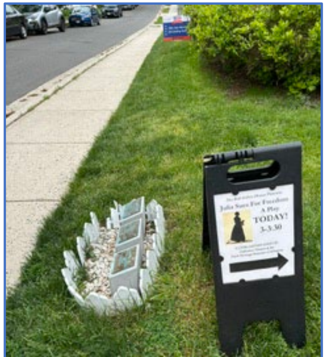
Sign about the play alongside three stumbling stones commemorating three people enslaved at the property