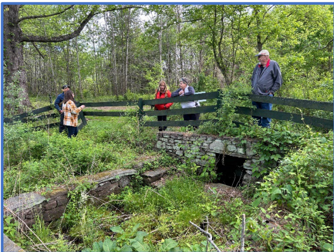
Springhouse at Banshee Reeks