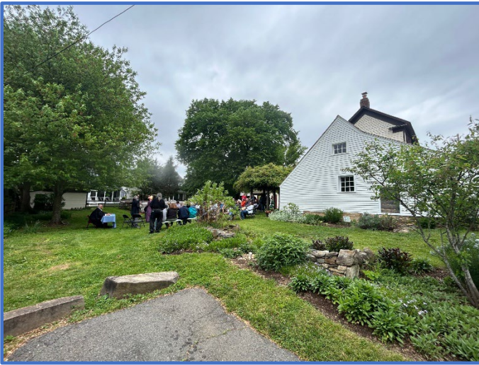
Ball-Sellers house during performance, as seen from the former lean-to, current rain garden