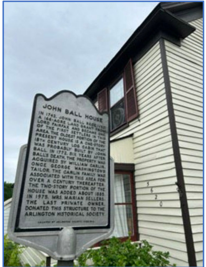
Ball-Sellers House built in 1742