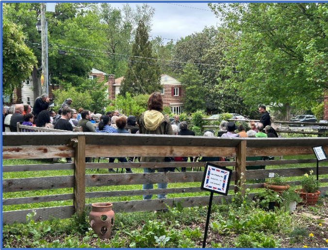
Performance viewed from current community garden